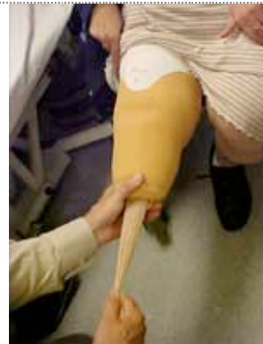
Fig. 3: Draw the nylon tail thru and ensure that the residual limb has good distal contact. As this is done, it is essential to push up on the distal end of the insert. Ensure when finished that the insert is fully donned. Check for distal contact and proper patella bar location.

Fig. 2: Create a nylon tube by cutting the end off a nylon sheath. Apply the sheath approximately half way up the residual limb over the desired ply of stump sock. Leave a long tail to pull thru.