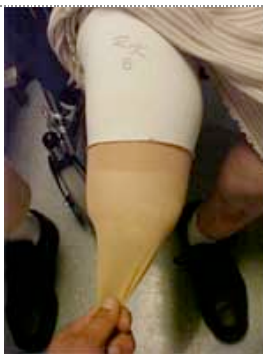
Fig. 2: Create a nylon tube by cutting the end off a nylon sheath. Apply the sheath approximately half way up the residual limb over the desired ply of stump sock. Leave a long tail to pull thru.

Fig. 3: Draw the nylon tail thru and ensure that the residual limb has good distal contact. As this is done, it is essential to push up on the distal end of the insert. Ensure when finished that the insert is fully donned. Check for distal contact and proper patella bar location.